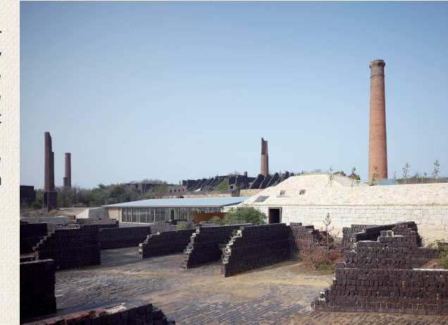
Inujima Seirenscho Art Museum