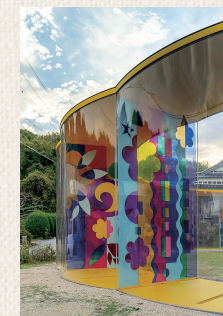
Inujima "Art House Project" A-Art House Beatriz Mlhazes "Yellow Flower Dream" 2018

Inujima Seirenscho Art Museum consists of the remains of the copper refinery, environmentally friendly architecture utilizing natural energy and artworks in the motif of Yukio Mishima. In Inujima Art House Project, you can walk around the village while visiting 5 galleries such as A-Art House, C-Art House and other artworks exhibited outside. Inujima Life Garden provides the place where you can experience the self-sufficient lifestyle in the cycle of nature from food to energy.