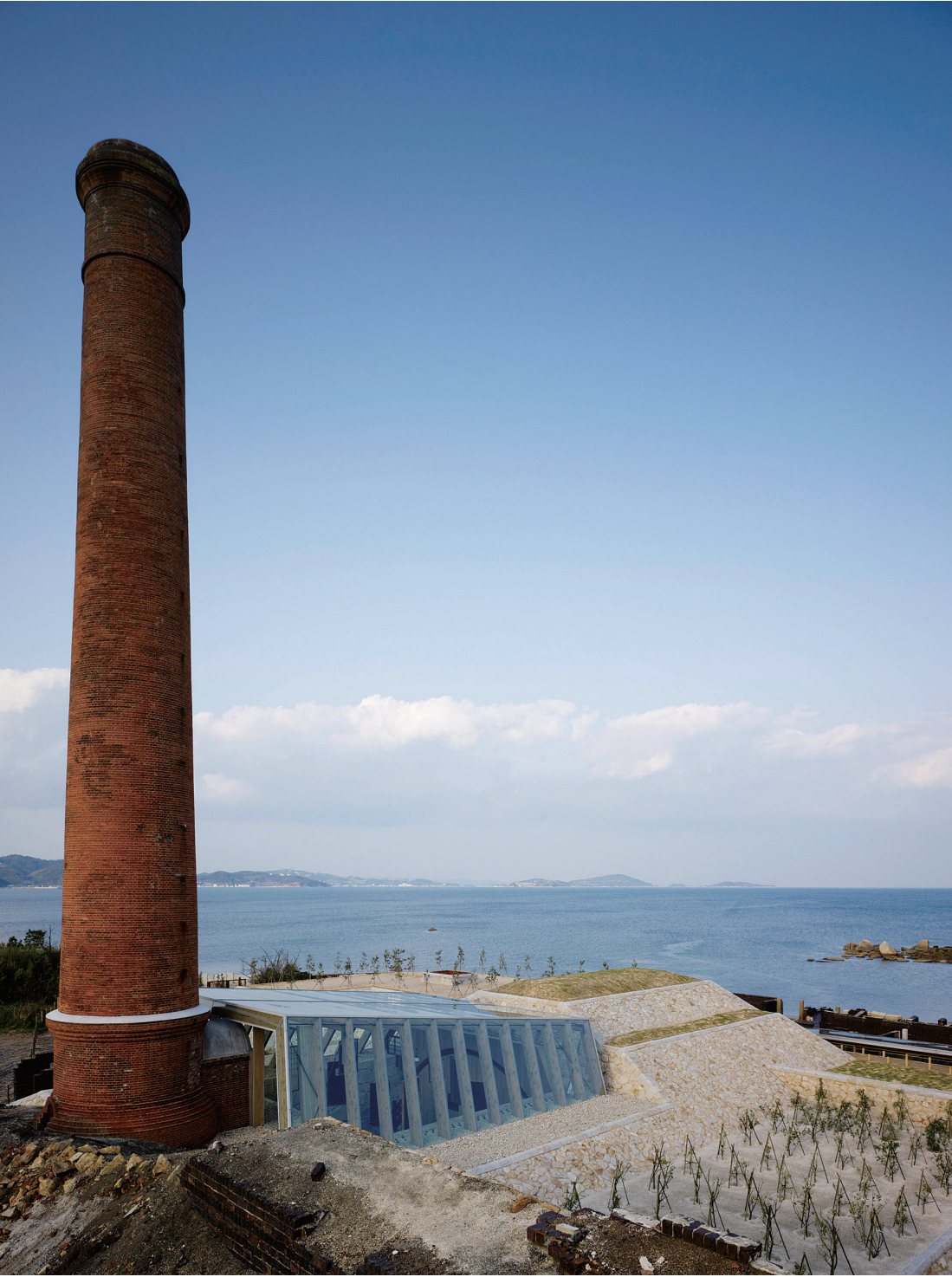
Inujima Seirensho Art Museum

Inujima Island is the only manned island in Okayama City, located in the Seto Inland Sea. Its circumference is about 4 km. Inujima Island produced high-quality granite, used for the stone walls of Okayama Castle and Osaka Castle. After Inujima copper refinery had opened in 1909, more than 5,000-6,000 people lived there at its peak. However, the refinery shut down its operation in only 10 years because the price of copper fell sharply. The current population decreases to approx. 40 people, but the island has been spotlighted as the "art island", which reproduces and restores the remains of the refinery as a heritage of industrial modernization to a museum.