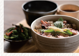
Octopus rice

Phone: 086-947-1112 Hours: 9:00-17:00 Closed: Closed when the museum is closed.