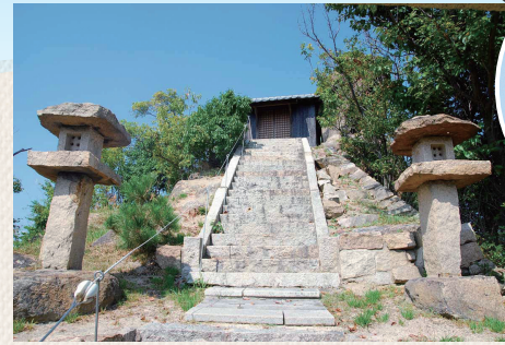
Yama Jinja Shrine

INUJIMA -literally meaning "Dog Island" comes from the legend of Michizane Sugawara's exile when he was caught by the tide on his way to Dazaifu. When he was about to be shipwrecked, he heard the cry of his deceased dog. He followed the cry and survived. The stone believed to contain the spirit of the deity is called "Inu-ishi sama", which means "Dog Stone", and is shrined on the top of the mountain on Inunoshima Island. An ema, a votive picture with a realistic painting of the former Inunoshima Island, remains in the Tenmangu that is dedicated to Michizane Sugawara. *You may not enter Inunoshima as it is a private area.